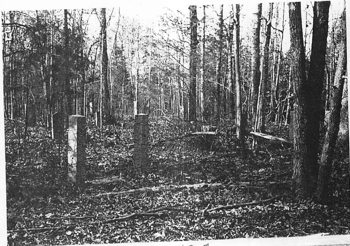
Trapp Cem #2 ♂